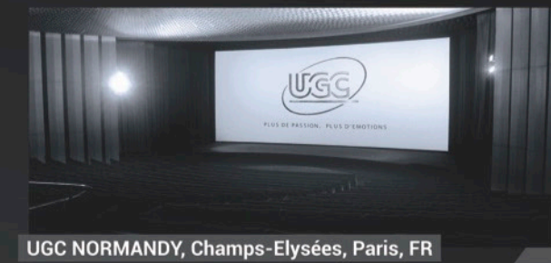
UGC NORMANDY, Champs-Elysées, Paris, FR